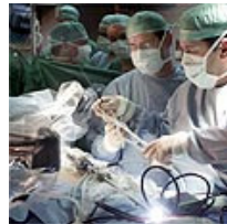
Funds to allow organization to perform heart surgeries on children in need