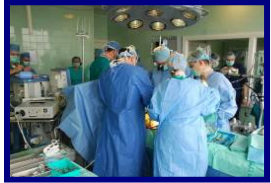
SACH and Moldovan Teams during Surgery